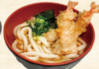
エビテうどん Prawn Tempura Udon $10.8