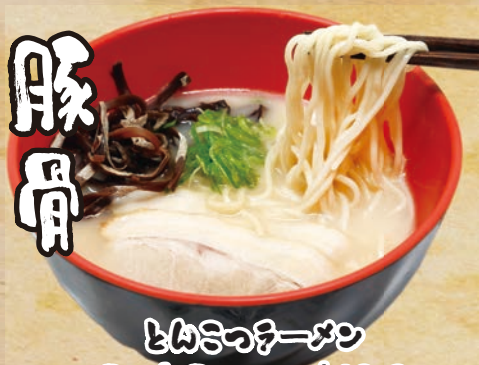
豚骨 とんこつラーメン Pork Ramen $10.8