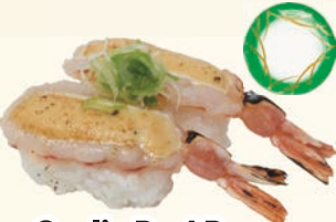
Garlic Red Prawn