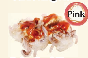
Spicy Squid Leg