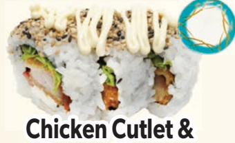
Chicken Cutlet & Cream Cheese