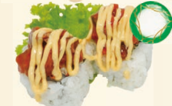
Yum Yum Roast Beef