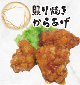
Chicken Karaage -Teriyaki-