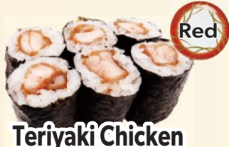
Teriyaki Chicken Thin Roll