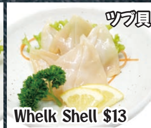
Whelk Shell $13