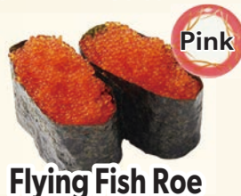
Flying Fish Roe