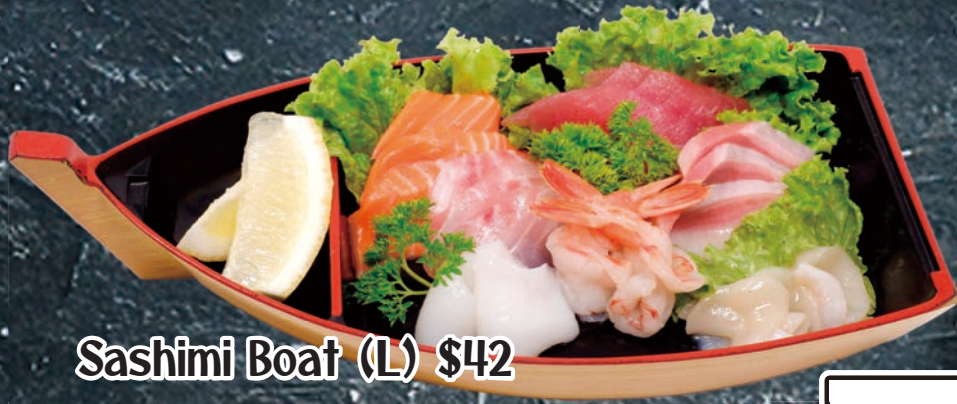
Sashimi Boat (L) $42

You could add your favourite Sashimi to your "Sashimi Boat" or order separately.