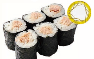
Chunky Tuna Thin Roll