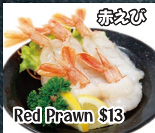
Red Prawn $13