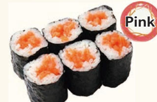
Salmon Thin Roll