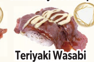
Teriyaki Wasabi WAGYU