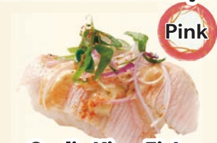
Garlic King Fish