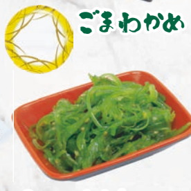
Goma Wakame (V)