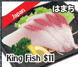
King Fish $11