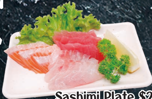
Sashimi Plate $23

Assorted fresh fish selected by experienced skilful chefs.