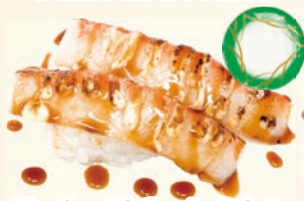
Teriyaki Crab Stick