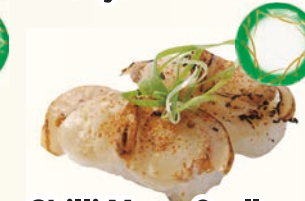
Chilli Mayo Scallop