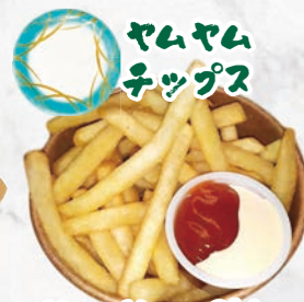
Yum Yum Chips (V)