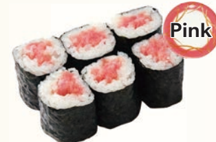
Tuna Thin Roll