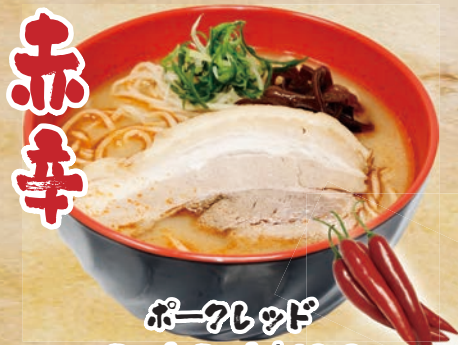
赤辛 ポークレッド Pork Red $10.8