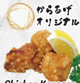
Chicken Karaage -Plain-