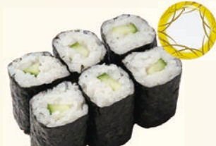
Cucumber Thin Roll