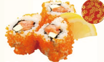
Salmon Cream Cheese