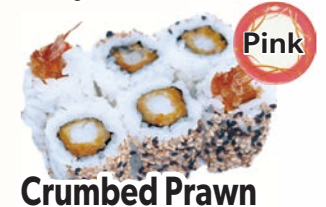
Crumbed Prawn Thin Roll