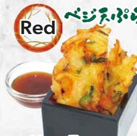
Vege Tempura (V)