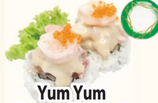
Yum Yum Prawn Seafood