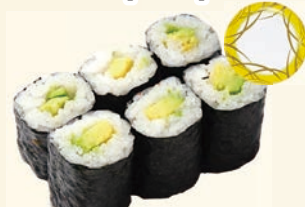
Avocado Thin Roll