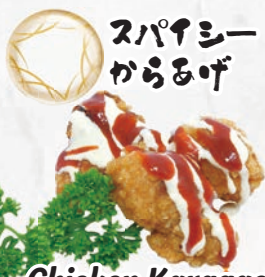
Chicken Karaage -Yum Spicy-