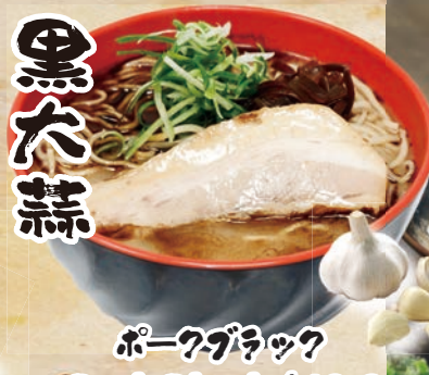
黒大蒜 ポークブラック Pork Black $10.8