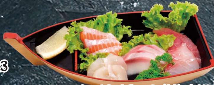
Sashimi Boat (M) $34

Goes well with Sashimi 日本酒 Japanese Sake