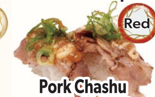
Pork Chashu Miso Mayo