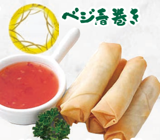
Vege Spring Roll (V)