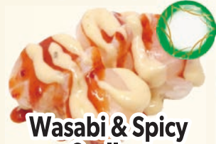
Wasabi & Spicy Scallop