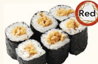
Natto Thin Roll