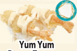
Yum Yum Prawn Tempura