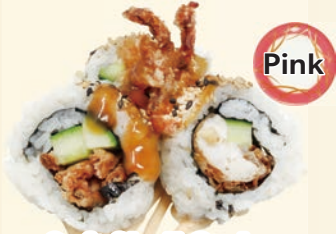
Soft Shell Crab