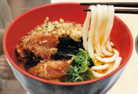
チキン唐揚げうどん Chicken Karaage Udon $10.8

The authentic Japanese taste experience Our Noodle & Soup are Carefully prepared in Japanese way