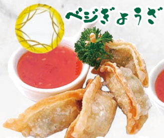
Vege Gyoza Dumpling (V)