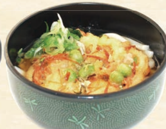
ベジテうどん Vege Tempura Udon $10.8