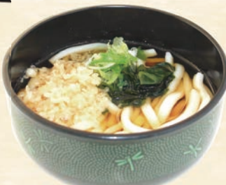
シンプルうどん Simple Udon $9.6