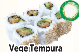
Vege Tempura Thin Roll