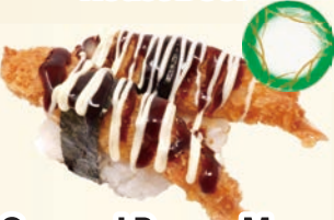
Crumed Prawn Mayo